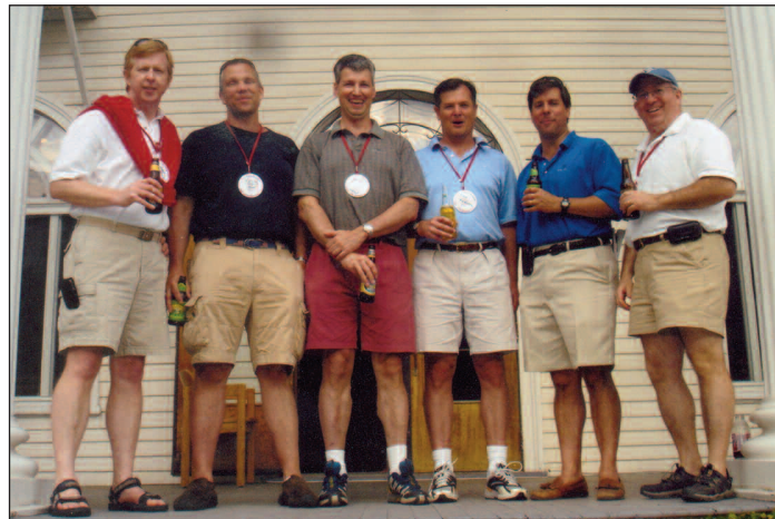
Gamma Phi Sigs from the class of '84.