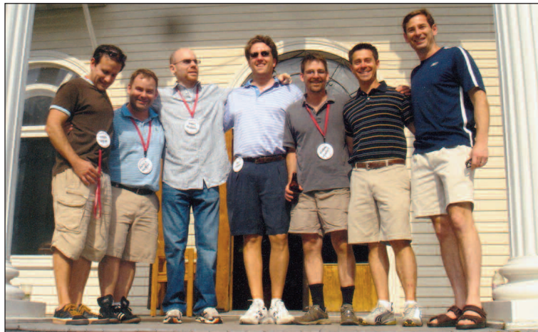
Gamma Phi Sigs from the class of '89.