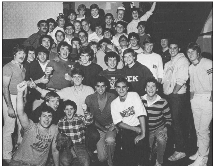
From the 1985 Cornellian: Can you believe it has been 25 years?