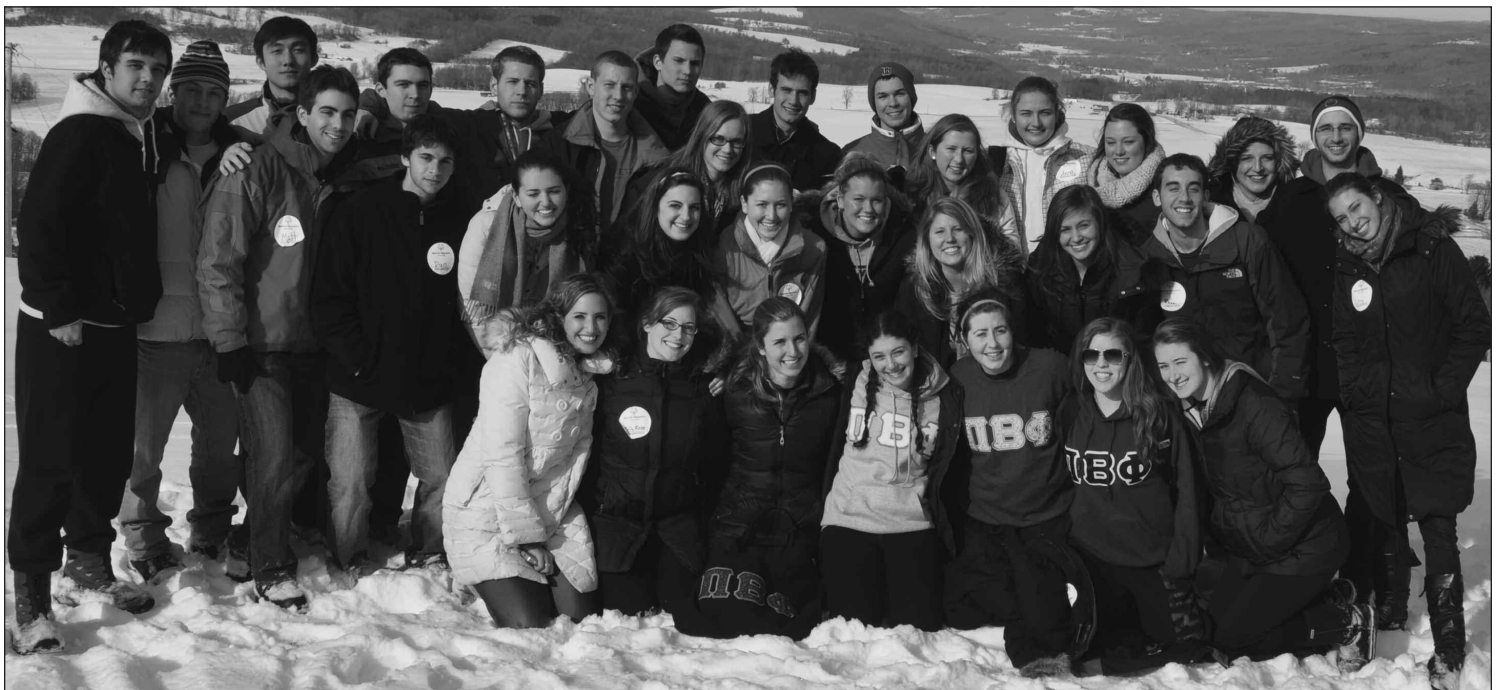
Brothers of Phi Sigma Kappa volunteered with sisters from Pi Beta Phi at the Winter Special Olympics.